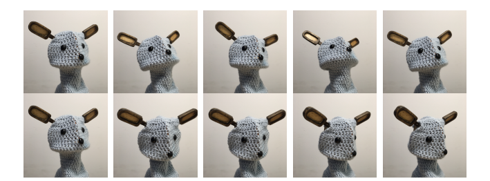
Fig. 3. Sequences of generated happy (top) and sad (bottom) movements.

Perceptual metrics can be used to subjectively evaluate the generated movements. As shown in Figure 3, the intended